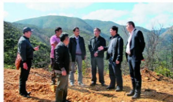
(多次召开会议讨论作业设计和实施方案) On Site Meetings on afforestation Design and Implementation Plan