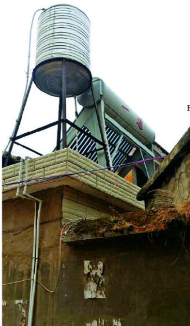
太阳能设施 Solar Water Heater Equipment