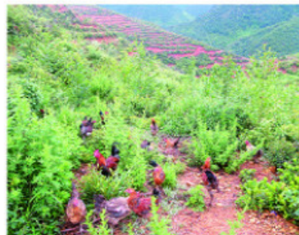
林下养鸡 Under forest poultry