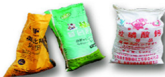
每穴施用化肥 100g Apply 200 gram fertilizer per Planting Hole

(5) 栽植方法: 早冬瓜栽植时, 容器苗撕去容器, 使带土根系露出, 将苗带土球放入栽植穴中, 栽正扶直, 使根系尽量舒展, 回填表土, 踏实, 浇足定根水。裸根核桃苗栽种时, 回填土, 每穴施钙镁磷肥 200g, 拌匀再回填土, 栽上扶植, 使根系舒展, 回填土踏实, 浇定根水, 插固定杆捆绑。