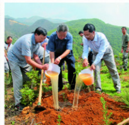
竹筒保水技术培训 Skill Training on Bamboo Tube for Water Holding