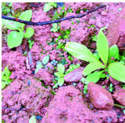
龙胆草撒播效果 Result of gentiana rigescens Sowing