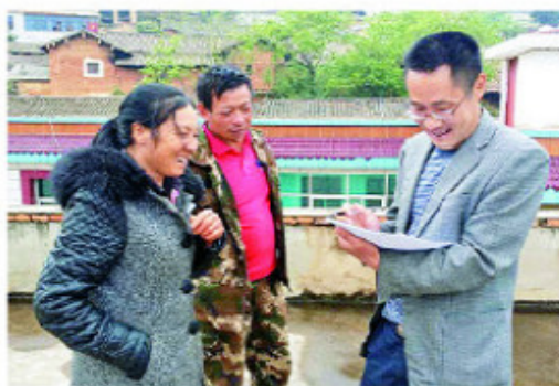
太阳能使用情况反馈调查 Field Investigation on Usage of Solar Water Heater