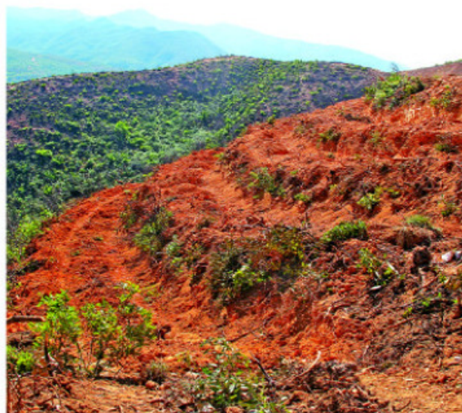
沿等高线带状整地 along the contour line

(2) 整地：核桃和旱冬瓜采用带状整地，穴状开塘。核桃开塘规格为80cm×80cm×80cm，旱冬瓜开塘规格为40cm×40cm×40cm；龙胆草采用带状松土，带宽50cm，深10cm，带间距50cm。