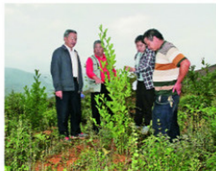
龙胆草长势喜人 Gentiana rigescen is growing well