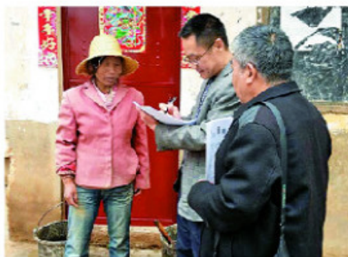
项目工作人员入户调查 Household Investigation by the Project