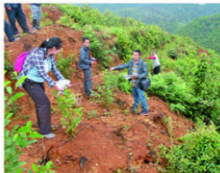
成果验收 Afforestation inspection

Our experience is the implementation of a project can change a place and help village people get rich. A beautiful new socialist village appeared in front of us. The nearby village named Nanying Village replicated the project model to afforest on fire-slash site. It declared the demonstration effect of the project.