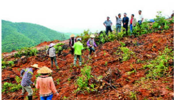
苗木栽植（一） Planting seedlings 1