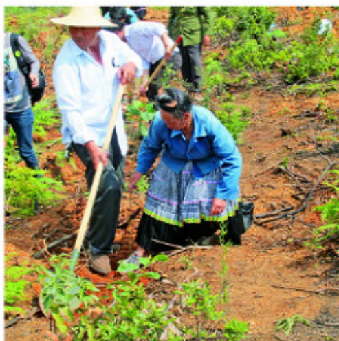
苗木栽植（二） Planting seedlings 2