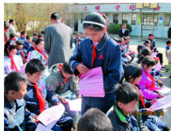
防火宣传及培训 Forest Fire Control outreach and Training