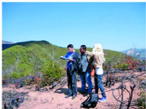
勘察核实项目作业小班 Field Survey of Forest Sub-compartment

1) The project team compiled project implementation planning and Vegetation Recovery Design on Fire-slash in Hanchongqing Beiyong Village of Yunnan, based on serious investigation after assignment. All works has been carried out serious according to the planning.