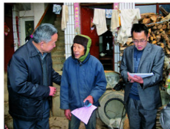
基金会领导入户调研 Household Investigation carried by the Fund

4) The project trained 1027 people on tree planting and forest fire control. Project staff delivered knowledge on forest fire control codes, none fire sacrifice, fire source management and so on. Questionnaire survey also carried out synchronously on 6th Oct. 2013.