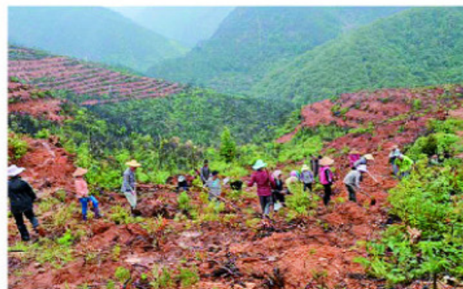
整地情况 Ribbon Pattern Site Preparation Along Contour Lines

(4) 造林时间：云南旱冲箐森林火灾迹地植被恢复造林周期为 2014 年 1 月至 2015 年 8 月，其中旱冬瓜造林时间为 2014 年 7 月，核桃造林时间为 2014 年 12 月，撒播龙胆草时间为 2014 年 6 月。