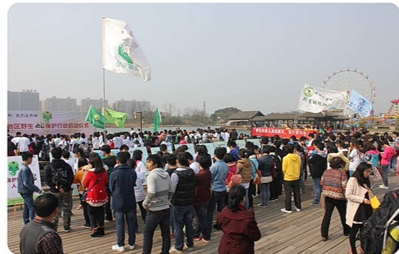
The launching ceremony of wild snake conservation actions sited in Changsha in 2014