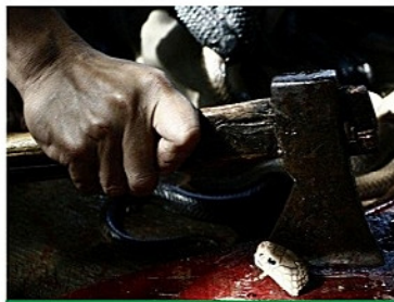
Difficulties for the investigation of killing and selling of wild snakes