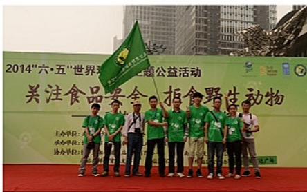
Press conference on World Environment Day, with the theme 'pay attention to food safety, refuse to consume wild animals' on June, 5th 2014

Volunteers will be asked to go campaigning around the main snake hunting sites in Changsha, to set up warning signs, patrol on a regular basis, and join forest police in confiscating snake hunting equipments. Meanwhile, teaming with snake farming experts, CSWCA will persuade villagers to abandon illegal hunting of wild snakes, and embark on domesticated snake farming as an alternative livelihoods so that the villagers could gain profit as well as sustaining ecological balance.