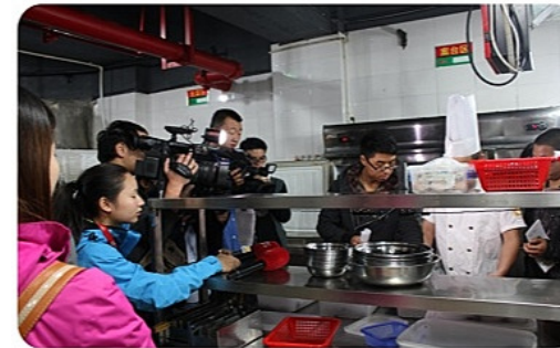
For the 'Zero snake consumption at restaurant' campaign, CSWCA Staff investigate in a restaurant kitchen whether there is wildlife ingredient