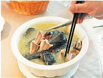
Lack of public awareness of conserving snake species