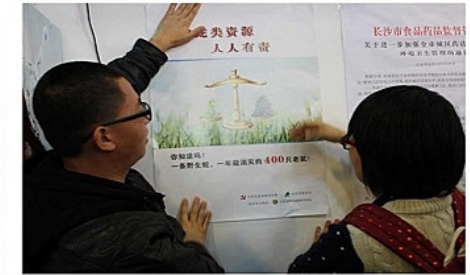
During campaign of 'Zero snake consumption at restaurant', volunteers put up posters in the restaurant