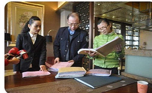
For the 'Zero snake consumption at restaurant' campaign, CSWCA Staff and law enforcement officers of Changsha Forestry Bureau check up purchase ledger in a restaurant

Through the implementation of the project, we intend to crack down on the illegal hunting and selling of wild snakes in Changsha. Hopefully, 10 common species like eastern garter snake, taeniura, king ratsnake, serpent, coral snake will be effectively conserved. 5000-7000 wild snakes are estimated to be released. We hope to establish a monitoring and supervision mechanism, with which the public can effectively participate in the wild snake conservation. Awareness and refusal to dine on wild snakes will be raised, and 10,000 people are expected to no longer consume wild snake. Through strengthening law enforcement, about 1/5 potential offenders will give up on illegal hunting, transport, and sale business. Over 50 restaurants will be awarded with green certification as 'zero snake consumption restaurant'. Through spread of snake domestication and establishment of 2-3 model snake farmers, we could not only benefit the subject area with alternative livelihood, but also gradually reduce the market consumption of wild snakes.