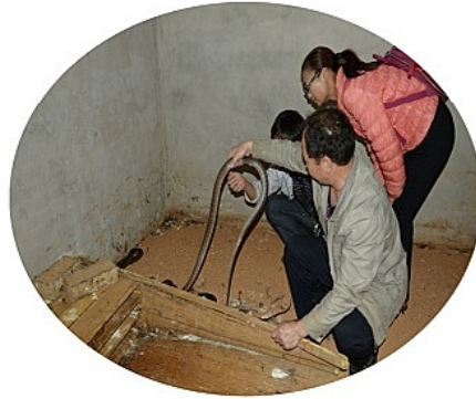
CSWCA Staff visit domesticated snake farms to study breeding and farming technology