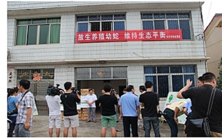
On September 10, 2014, the City Forestry Bureau released domesticated baby snakes