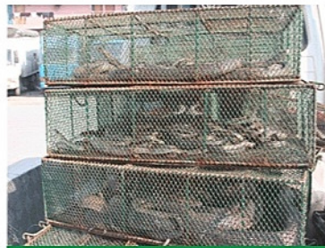
Current snake farming failed to supply enough to meet the growing need for snake consumption