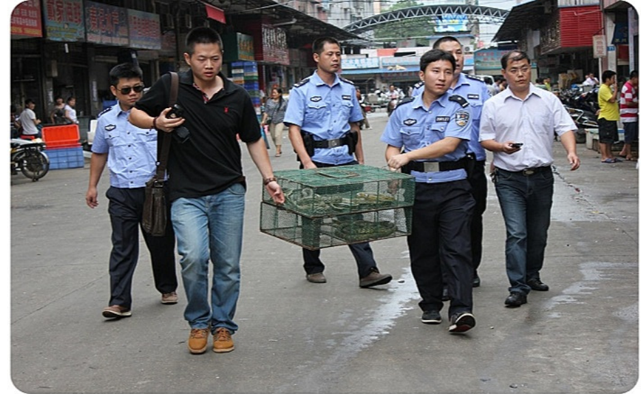
Spot checks on wild snake sale market by forest and wildlife conservation Sector and forest police of Changsha forestry bureau

The project's first stage started from May 2013 to June 2014