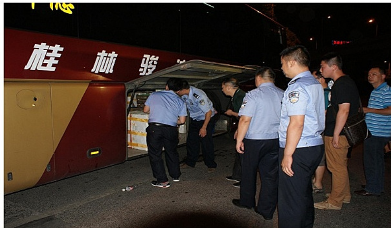
Forest Police of Changsha investigate in the smuggling of wild snakes at Changsha West Bus Station