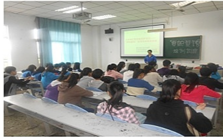
CSWCA Staff give training seminars at universities in Changsha on the 'Zero snake consumption at restaurant' campaign

During the stage CSWCA had set up a website, a forum and a microblog specialized for snake conservation and caring for propaganda. The launching ceremony with the aim of conserving wild snakes had been held in Changsha, followed by a public activity called 'snap shot to rescue wild snake' aiming at reporting clues of illegal hunting and marketing of wild snakes. Volunteers are then asked to gather evidence from reporting and inform the forest police. In this way legislation and law enforcement could be strengthened, and the captured wild snakes could be rescued for field release.