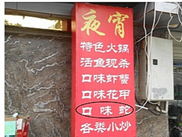
Widespread of restaurants serving snake dishes