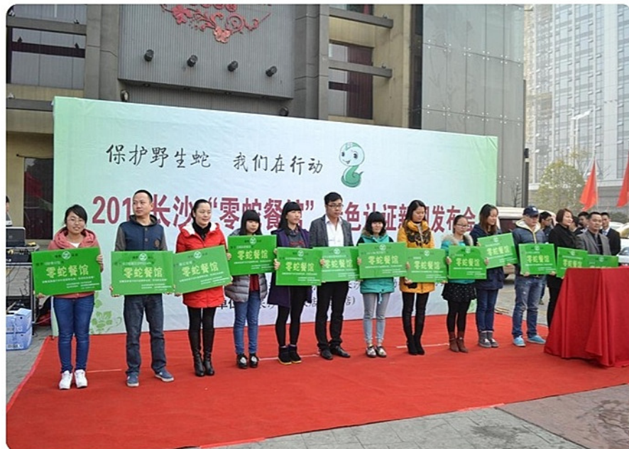
Press conference for green certification of 'Zero snake consumption at restaurant'

As a corporate programme funded by the Global Environment Facility (GEF), Small Grants Programme was established in 1992, implemented by the United Nations Development Programme (UNDP) on behalf of the GEF partnership, and executed by the United Nations Office for Project Services (UNOPS). SGP channels financial and technical support directly to NGOs and CBOs for activities that conserve and restore the environment while enhancing people's well-being and livelihoods. SGP supports activities in these priorities - biodiversity conservation, abatement of climate change , protection of international waters, prevention of land degradation and elimination of persistent organic pollutants. With presence in more than 125 countries, SGP has awarded more than 14,000 grants worldwide.