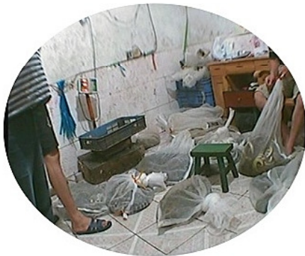
Volunteers visit trading spots of wild snake to conduct undercover investigation

In future, we also consider conducting research projects on population census and restoration of endangered snake species to conserve genetic and species diversity of wild snakes.