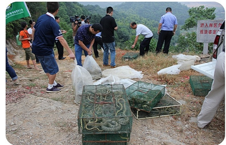
CSWCA Staff and law enforcement officers of Changsha Forestry Bureau release confiscated wild snakes to the wild