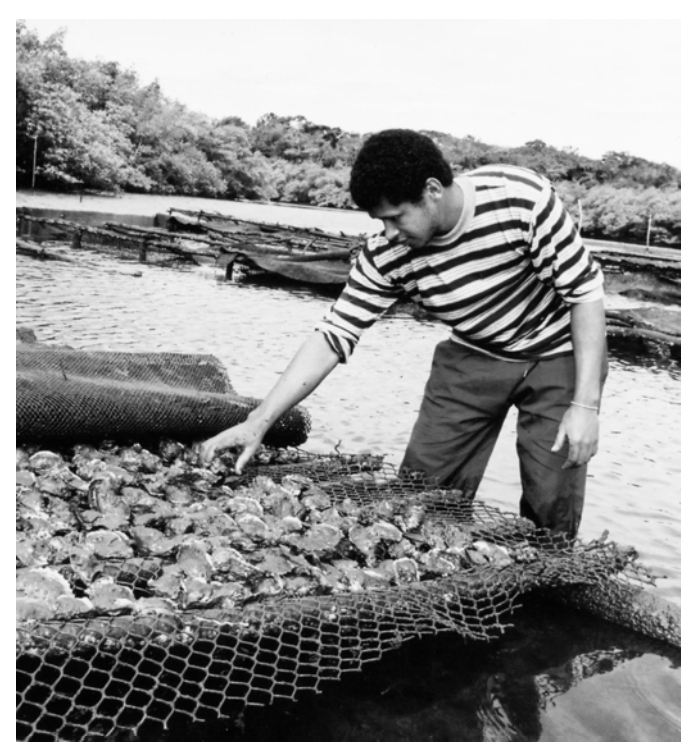
Oysters undergo a process of fattening and cleaning to meet with government regulation and market demand (Brazil)

The Mandira Neighborhood Extractive Reserve is the nucleus of this initiative. The traditional population in the community is comprised of Caiçara (the coastal region population) and Quilombolas (descendants of African slaves). The community lives in Cananéia, in the Ribeira River Valley, on the southern shores of the state of São Paulo. Until the 1960s, descendants of the first Mandira community lived off agriculture and plant harvests. Many have since migrated elsewhere; those who stayed turning to oyster harvesting to make their living.