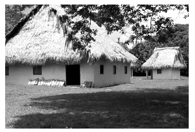
"Ecopaths" crisscross through villages and connect ecotourist lodges (Honduras).

The Garífuna culture and the physical geography of the region are both genuine tourist attractions. This group of Garifuna women came up with the idea of designing a series of "ecopaths" along the north coast of Honduras, within protected areas and buffer zones, as a means of generating income for the communities and generating knowledge about the region.