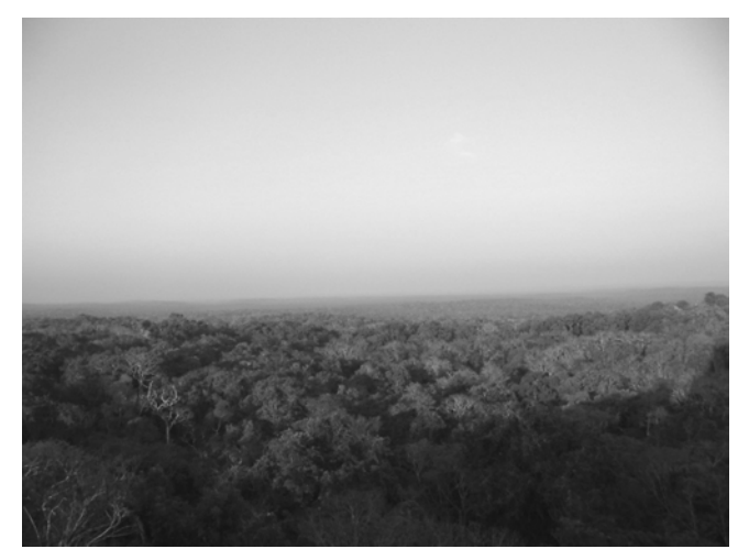
Over 450000 hectares of forest are being used on a sustainable basis to advantage local communities (Guatamala).

The project sought to improve the livelihoods of forest communities of the Petén through the sustainable management of its natural resources, the conservation of its natural resources, and self-management by forest communities.