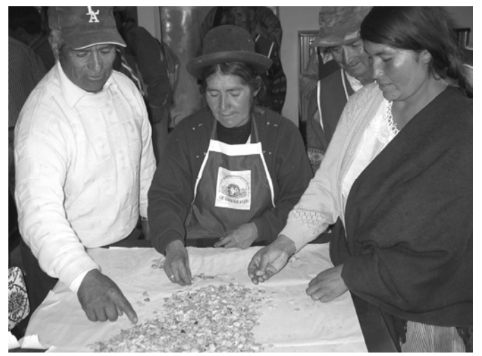
Rio Abajo community members apply Palqui fruit processing techniques (Bolivia).

The semiarid ecosystem is fragile and subject to pressure from uncontrolled grazing and to the unsustainable use of forest resources. Loss of the vegetation layer is quickly creating soil erosion problems, reducing the production of the palqui fruit, and preventing the community from benefiting from its byproducts: tostado (roasted beans), mates (herbal teas), pito (flour), and cookies.