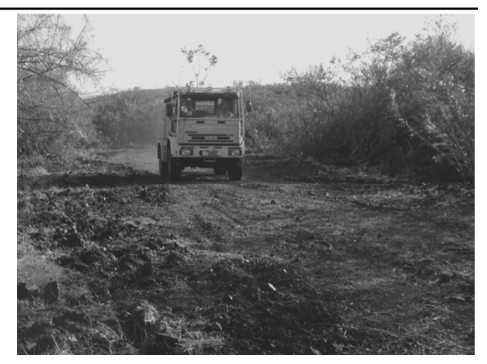
Local cattle-raisers firefight to protect forest ecosystems (Costa Rica).

The project aims to control the incidence of fires in the Sardinal area to ensure the protection of the natural environment. Additionally, the project seeks to strengthen the region's firefighting capacity by creating incomegenerating activities that will allow for the medium and