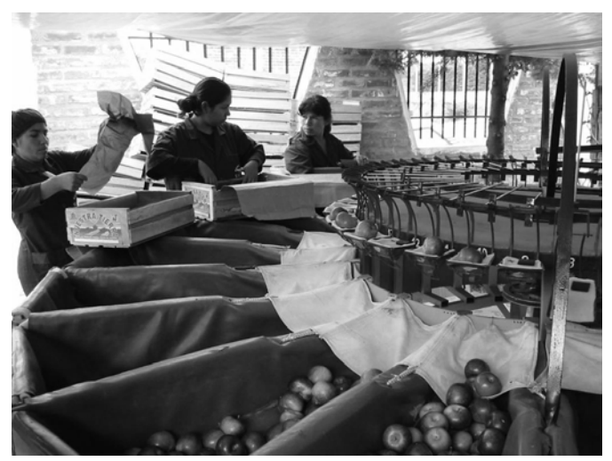
Members of fruit producing associations implement quality control system (Bolivia).

The municipalities have traditionally had the most success in producing fruit. However, the insufficient techniques by which fruit trees have been managed has reduced crop yields and lowered crop quality. Producers have not used varieties resistant to disease, have neglected to prune the