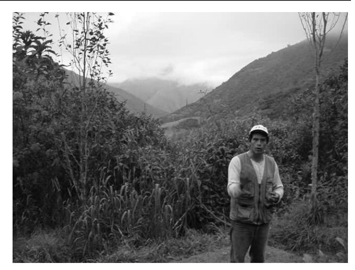
Ecotourism is used to combat deforestation in a mountainous protected area (Ecuador).

As an alternative to unregulated forestry, the project proposed the implementation of ecotourism activities to integrate and leverage the various agroecological and forest management initiatives in the area. Additionally, new productive activities were set up to motivate the community and generate tangible economic benefits.