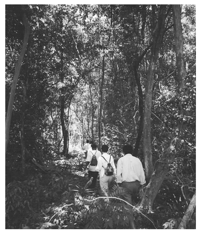
Forest transect for sustainable certified logging

The COMPACT project sought to improve company operations, raise the qualifications and skills of the SPR's work force, and qualify for certification of its labor units. The projects pursued these objectives through well-defined management criteria, clear and inclusive decision-making processes, optimization of the administrative council,