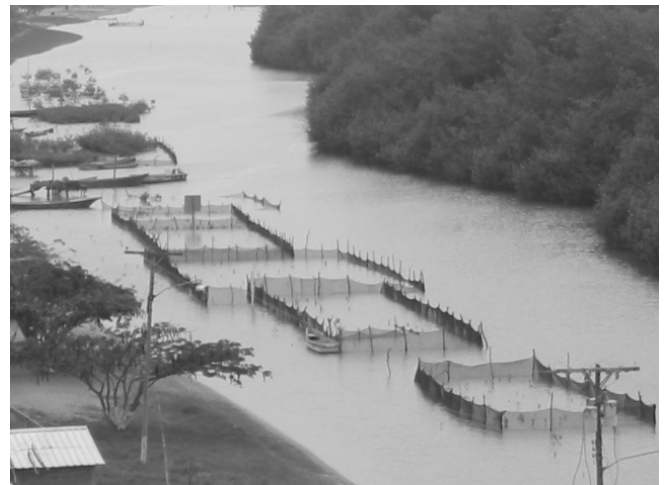
Clam and crab recovery in the mangroves of the Island of Costa Rica (Ecuador).

With the goal of halting the unregulated use of natural resources, and the subsequent decimation of marine species and decrease in fishing yields, the organization launched a campaign to save the mangrove. Toward this end, the organization monitors the mangrove, manages its use, and organizes community-based self-management mechanisms.