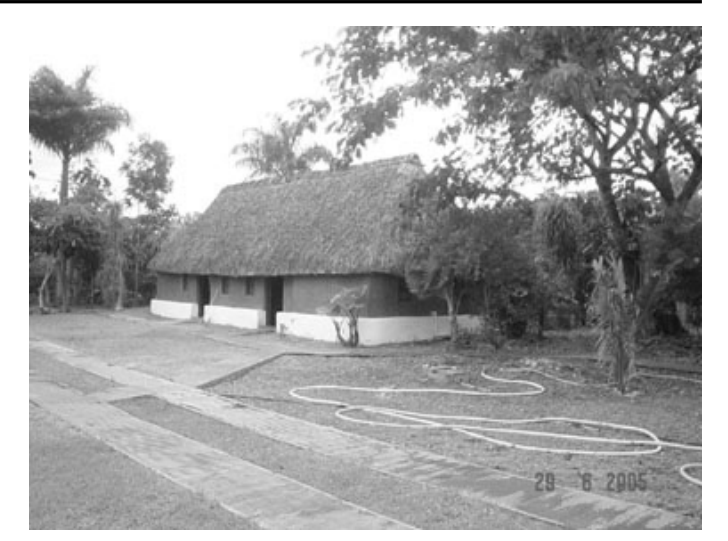
Bilingual Mayan/Spanish School of Ecological Agriculture (Mexico)

Under-development, more than the consequence of insufficient resources, is generally the result of insufficient knowledge among rural communities. These communities lack knowledge of how to use their resources more efficiently and how to best apply technologies that are culturally, economically, socially, and environmentally compatible. By combining traditional know-how and skills with external technical assistance, it is possible to generate opportunities for rural communities to improve their livelihoods, living standards, and needs.