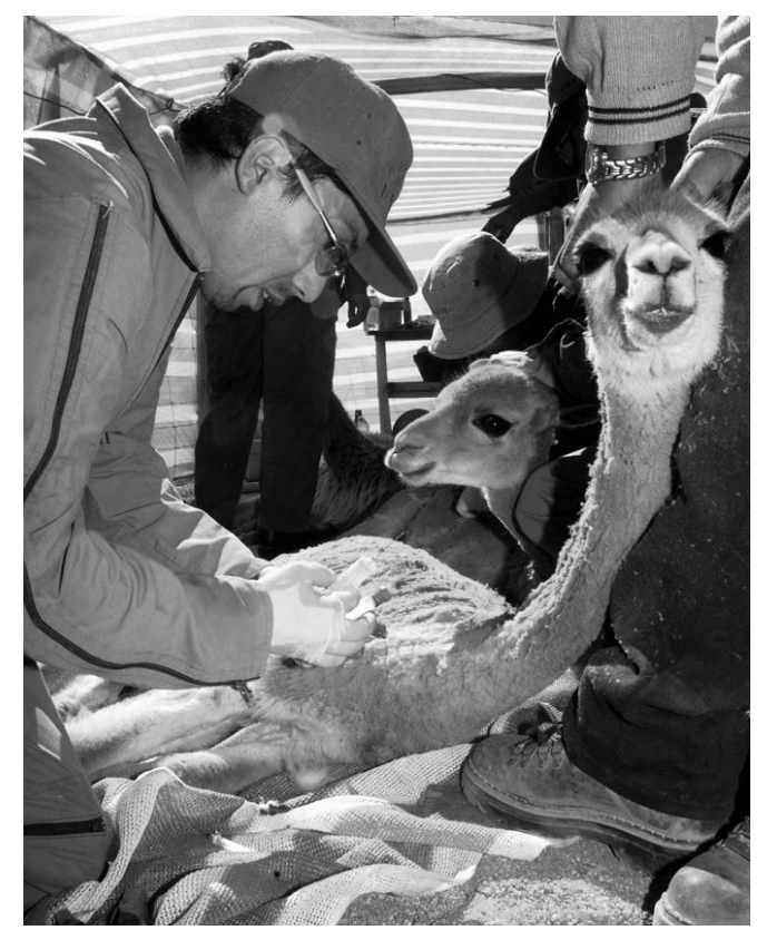
The sustainable shearing of vicuña wool generates income and is an incentive for vicuña protection (Chile).

The project sought to develop a sustainable management plan for the vicuña with the participation of Aymara communities. The first project objective was to protect vicuñas from poaching. The second objective was to design a sustainable management system for the vicuña; one that encourages conservation and generates income for the region's inhabitants. The third objective was the design of a herding system to allow for sustainable shearing: cutting the wool for stockpile and sale. The final objective was to situate the wool in reliable markets at the highest possible price.