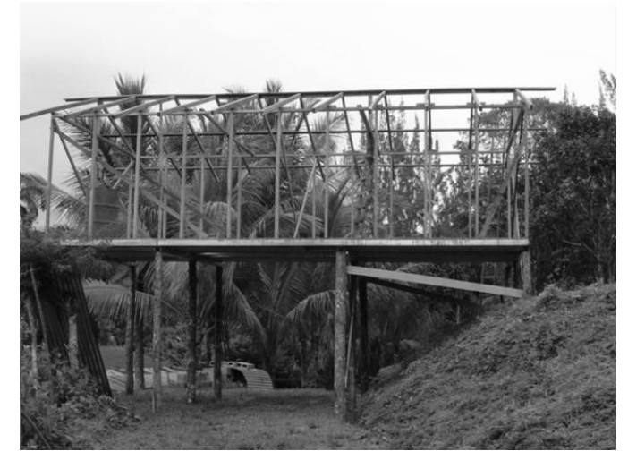
Fertilizers and bioferments are produced to sustain soil productivity for organic coffee production (Costa Rica).

The Association of Agroecological Production Families of the South (AFAPROSUR) aims to produce, process, and market organic products at a constant rate, guaranteeing a balance between food security for consumption needs of families in the community and market demands by way of produce for market and sale. The association allows the community to produce their organic products with an agroecological approach, ensuring the ecological and economic sustainability of their activities.