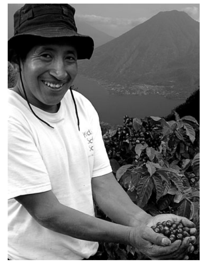
Organic coffee production is complemented by efforts to reduce the contamination of water sources from pesticide and fertilizer run-off (Guatamala).

Environmental degradation and contamination from agrochemical waste complicates and threatens the short and long-term health of inhabitants of the country's coffeegrowing areas.