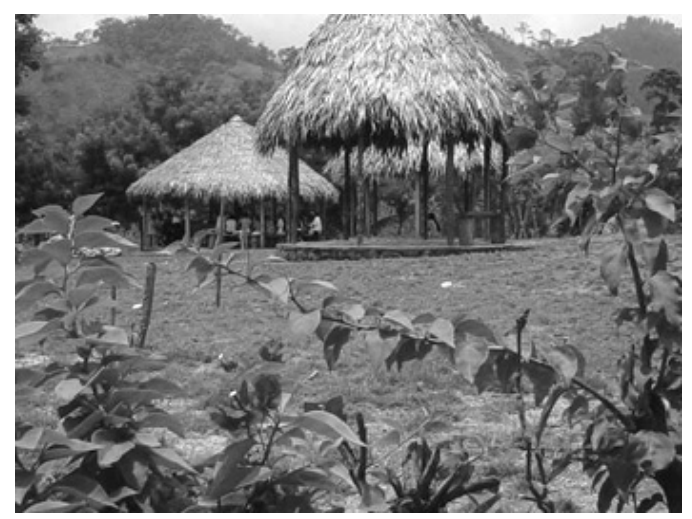
Ecotourism generates investments in environmental education (Honduras).

This project aimed to leverage the region's natural resources through sustainable ecotourism. The initiative involved human resources training in the areas of ecotourism, management of protected areas, food preparation, basic administration, and customer service. The project involved the construction of six huts (four small, two large), cooking and parking areas, and repairs to some segments of the main access road.