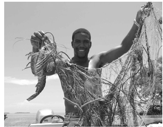
TIDE trains community residents to be guides and stewards of the Port Honduras Marine Reserve (Belize).

TIDE was founded in 1997 to respond to the negative environmental effects of unsustainable resource use (such as manatee poaching, illegal fishing and logging, and destructive farming methods) focusing on conservation. In particular, its formation was a reaction to a spate of manatee killings in the Gulf of Honduras - Belize is home to the largest population of the endangered West Indian