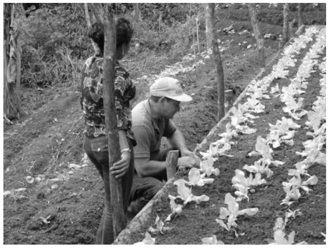
Small organic farms are used to promote production and development alternatives in the agricultural sector (Costa Rica).

The Costa Rican Organic Agricultural Movement (MAOCO) has been consolidating membership since the 1990s. The organization's stated purpose is not to attack the conventional agricultural sector or the import and