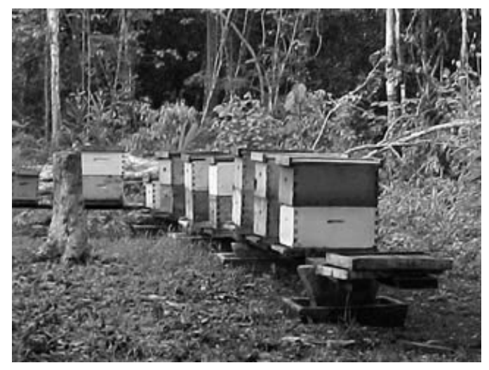
Improved beehives, Quintana Roo (Mexico)

The project seeks to consolidate beekeeping as a sustainable alternative for the conservation of natural