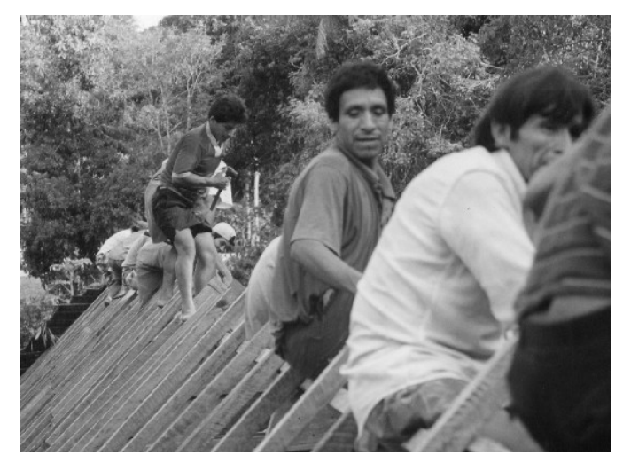
Ese'eja community members work in the construction of a Posadas Amazonas lodge in a joint ecotourism venture with Rainforest Expeditions (Peru).

The TCRZ protects the biological diversity of the Tavara watersheds, the Candamo Rivers, and most of the watershed of the Tambopata River, all of which shelter an extraordinary diversity of flora and fauna and form one of the richest natural areas on the planet. The reserve protects habitats ranging from the river headwaters of the Andean highlands, through some of the last remaining intact cloud forests, to the lowland rainforests of the Amazon basin. One of the highlights of the reserve is the Colpa de Guacamayos, one of the largest natural clay