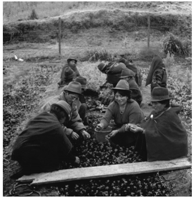
Food security and crop diversification is achieved through recovered agricultural techniques, tubers, and cereals (Ecuador).

The project, initiated by three women's organizations from the Lupaxi-Convalecencia, Cintaguzo and Pulucate Alto communities, has been devoted to the recovery of native agricultural varieties to diversify agricultural production and ensure food security by managing crops on an agroecological basis. Additionally, the project aims to rescue and increase the production of native forest plants for use as wind-breaking curtains and live fences. Project activities complemented efforts to strengthen women's