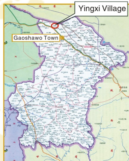
The position of Yanchi County in Ningxia and Yingxi Village in Gaoshawo Town of Yanchi Country:

Yingxi village of Gao' sha' wo town in Yanchi, as the project area, administers five natural villages with 260 households and a population of 886. It covers an area of 150,000 Mu (i.e. 10,000 hectare), which includes 100,000 Mu of grasslands and 30,000 Mu forest land. And 50,000 Mu of its land is desertified. The total farmland is 7,198 Mu, of which 150 Mu land is irrigated land (all in Min' zhuang' zi natural village). The total number of sheep is 4,000 and that of cattle is 10 in the village.